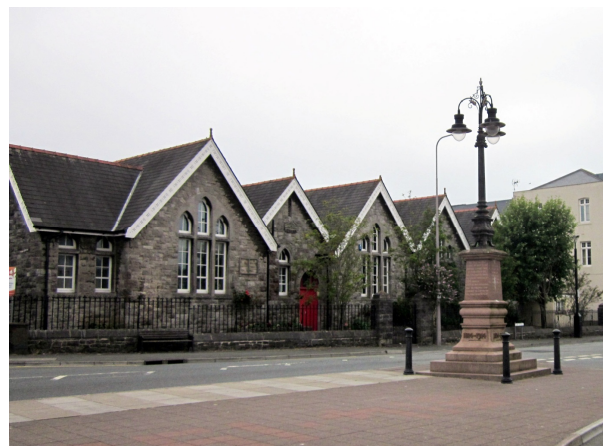
The School at Albion Square, Pembroke Dock

Dock Borough Council and Education Authority in building a school to cater for the needs of children in that part of Pembroke Dock. He notes the pride of stonemasons for the dressed limestone form which the school was built. Children started at age 3 and “attended in all weathers, the boys wearing hob nailed boots.” The only heating was a coal fire and grate in each classroom.